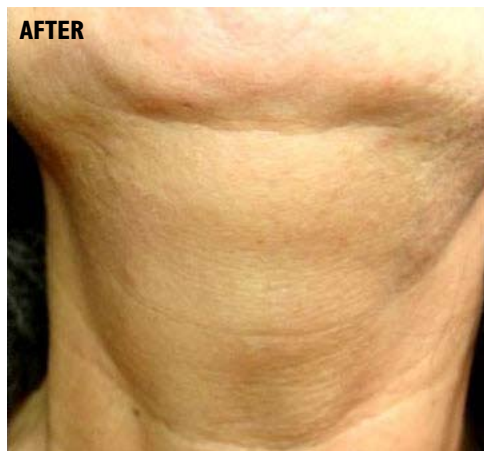
Loose, sagging and wrinkly skin on the neck is not only lifted and tightened but also looks much more rejuvenated after Plexr treatment.