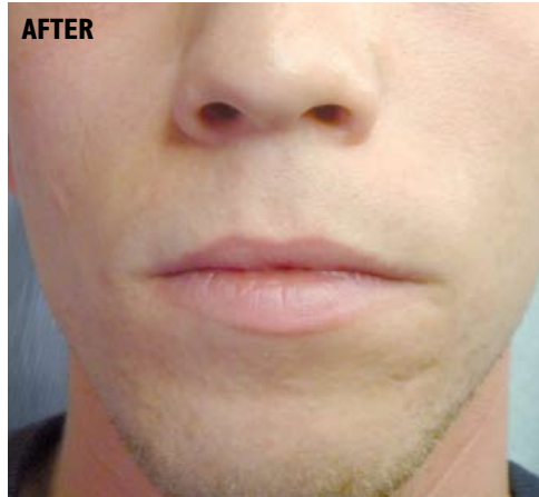
Active acne drastically reduced with minimal scarring after Plexr.